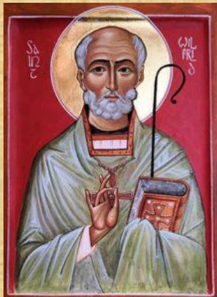
St. Wilfrid 633 - 709