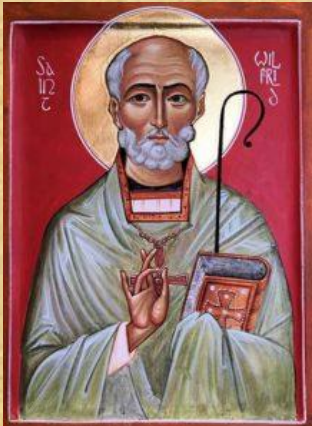
St. Wilfrid 633 - 709