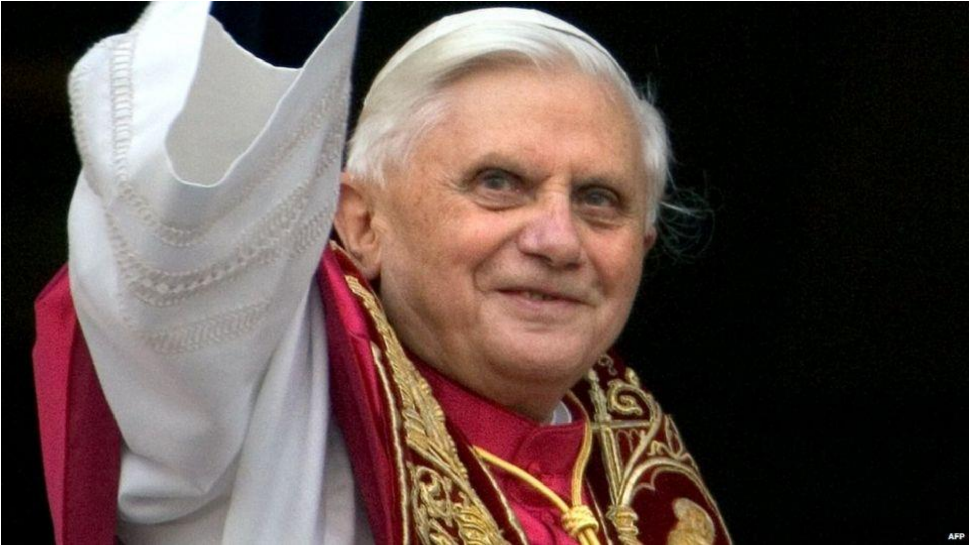
He became Pope Benedict XVI on 19 April 2005, when he was 78. Here he is waving to the crowds in Vatican City, Rome.