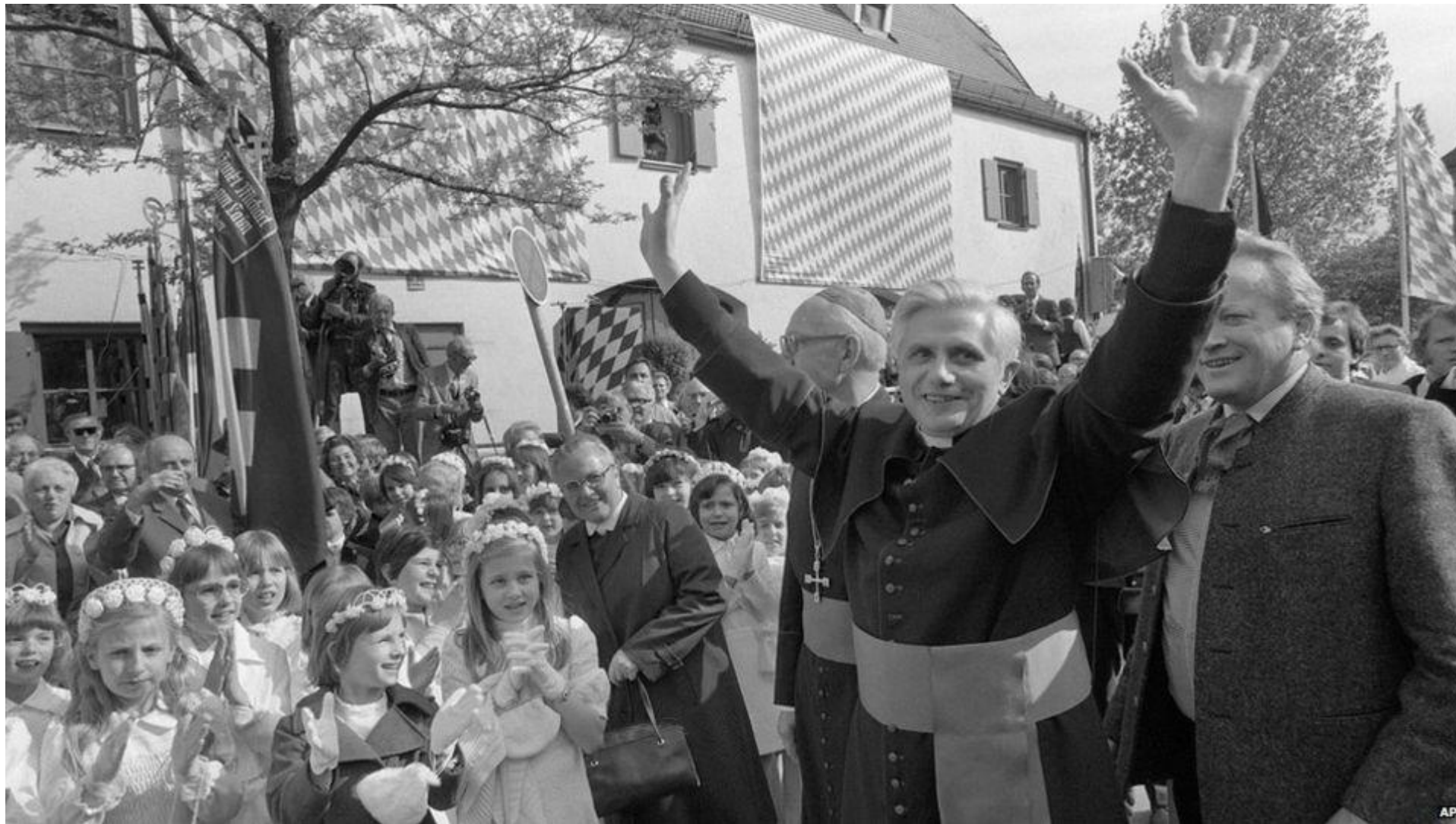
In 1977, Pope Paul VI appointed him Archbishop of Munich - and then cardinal.